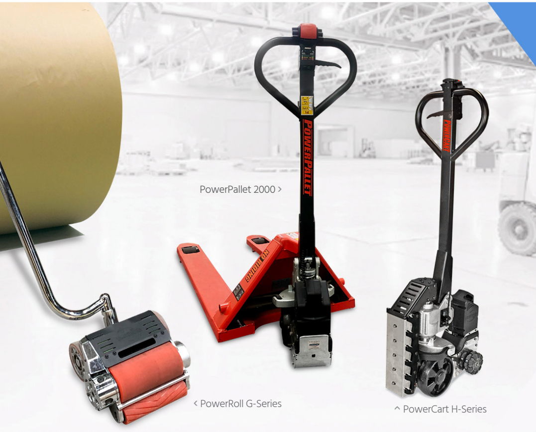
PowerPallet 2000 >