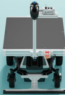
Memory Trace® Mode Autonomous Navigation (Memorise and Playback)