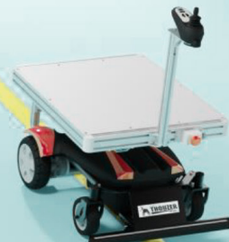
Line Trace Mode Retro-Reflective Line Tracking Navigation