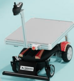
Follow Me Mode Target Tracking Navigation